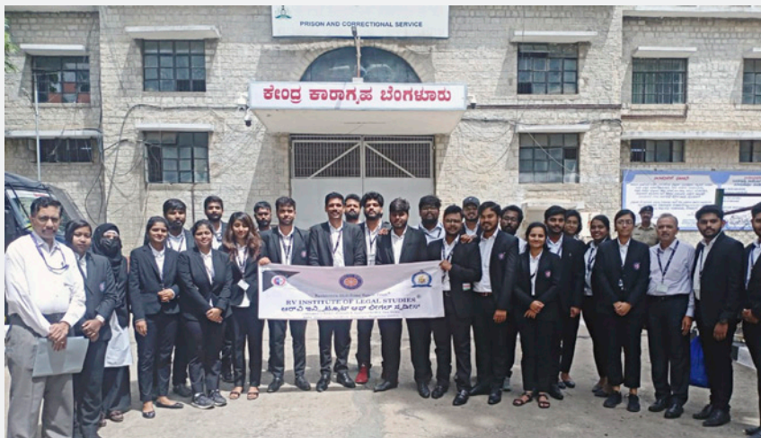
Central Jail Visit