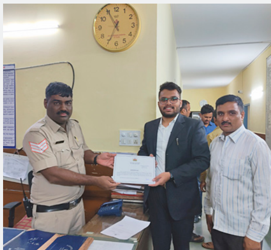
Police Station Visit

These visits allow understanding of the administration and environment of the Police Station and Jail.