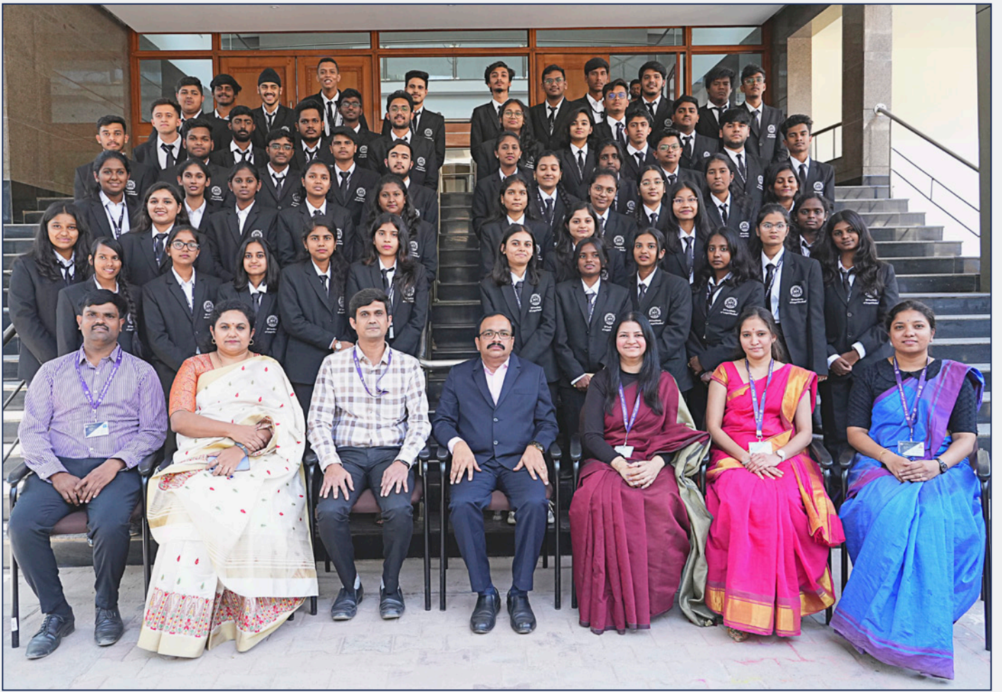
1 st Semester B.B.A.,LL.B.