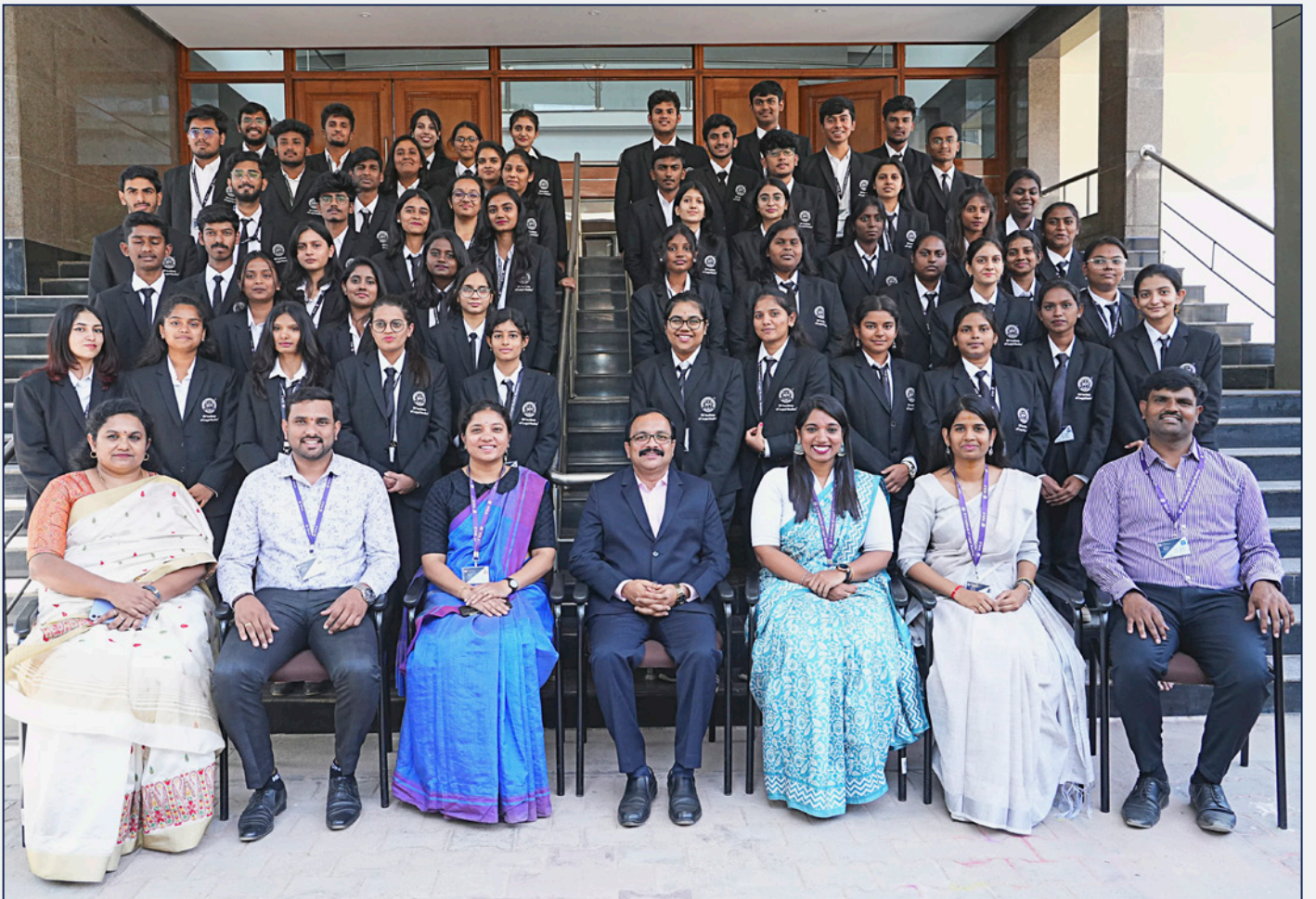
1 st Semester B.A.,LL.B.